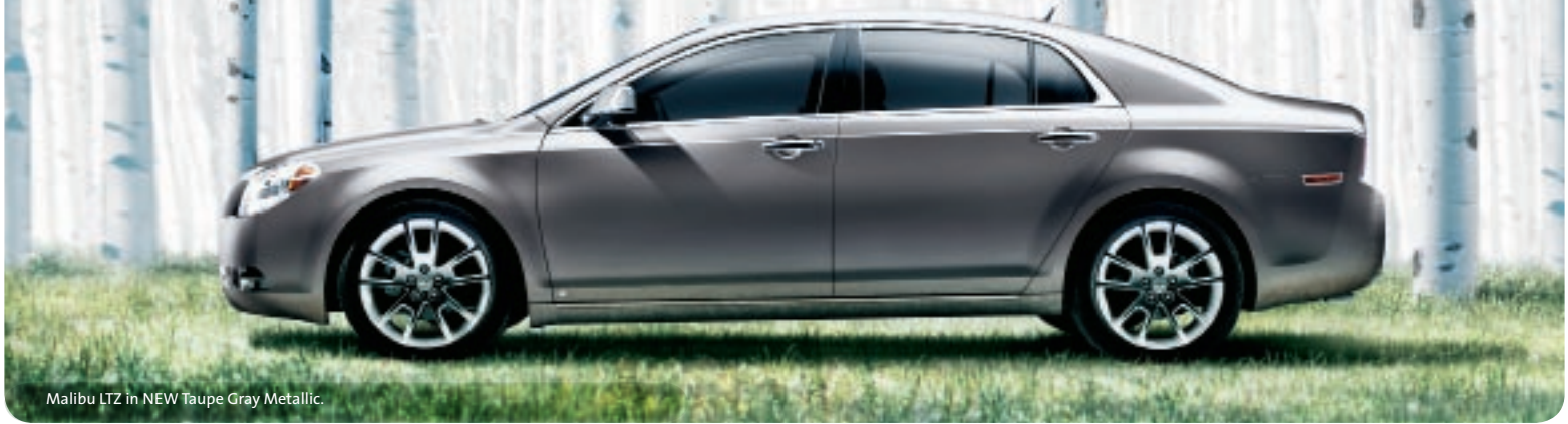
Malibu LTZ in NEW Taupe Gray Metallic.

Heralded by critics and owners alike — with more than 30 awards to its credit — Chevy Malibu continues to command attention and acclaim. The 2009 Malibu was named a Consumers Digest “BEST BUY.” And Malibu was named a 2009 BEST NEW FAMILY VEHICLE by Kelley Blue Book’s kbb.com ! A beautifully crafted car with a precision build and attention to detail, it’s also fuel-efficient, offering an EPA estimated 33 MPG highway? “Just drive one, and you’ll see why we’ve named it an AUTOMOBILE Magazine All-Star for two years in a row...” — AUTOMOBILE Magazine , February 2009